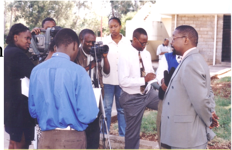
Briefing the media on expected health impacts after a Climate Outlook Forum – Nairobi, Kenya